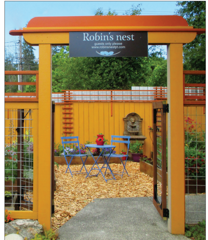
The courtyard and garden at Robin's Nest.

1190 21st St., Port Townsend www.RobinsnestPT.com 208-390-5327