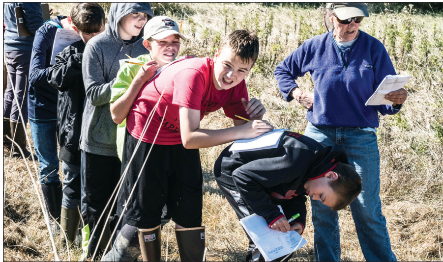
Local students take notes on Real Learning, Real Work fieldtrip.

Teachers and students in Clallam and Jefferson counties participate in year-long programs directly targeting Science, Technology, Engineering and Mathematics (STEM) curriculum requirements. Students gain a better understanding of healthy ecosystems and foster an intimate relationship with